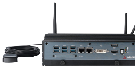
MXE-5400 with Antenna