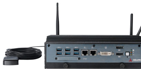
MXE-5400 with Antenna