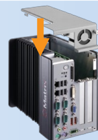
3. Replace it by plugging the hot-pluggable fan module cover into the fan connector on CPU board