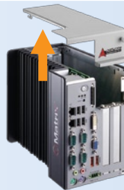
2. Withdraw the thumbscrew and remove the top cover