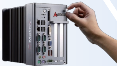
1. Undo the thumbscrew by hand