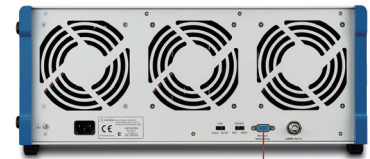
Remote Monitoring Port