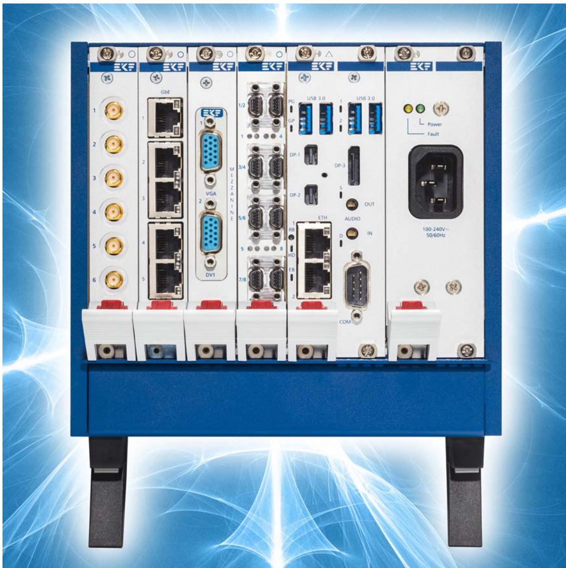
Typical System Configuration