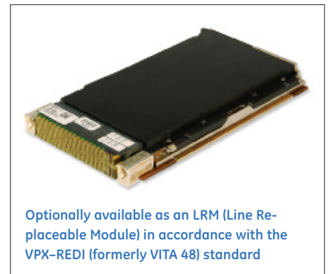
Optionally available as an LRM (Line Replaceable Module) in accordance with the VPX-REDI (formerly VITA 48) standard